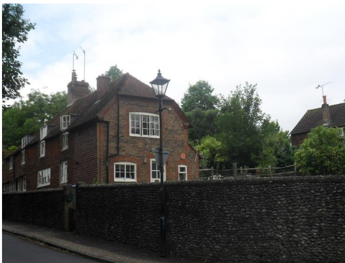
(2 Church Lane)