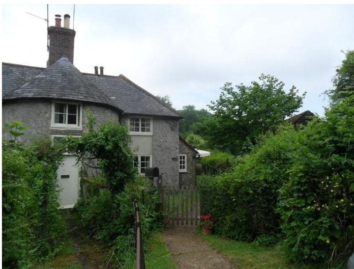
(2 Round Robin)