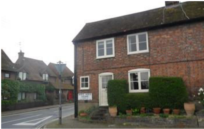
(1 Whitehorse Square)

Name - 1, 2 & 3 WHITE HORSE SQUARE, CARLTON STREET District - Horsham Grade - G II List UID - 1354024 OS Grid Reference - TQ 1711 24/57 Summary Early C19. Two storeys. Six windows. Red brick and grey headers alternately. Tiled roof. Horizontally sliding sash windows. - 1 Whitehorse Square – timber framed- 2 bedroom end of terrace with solid fuel heating. KITCHEN AND BATHROOM DATED - 2 Whitehorse Square – timber framed - 2 bedroom mid terrace with electric boiler – Condition: GOOD - 3 Whitehorse Square – timber framed - 2 bedroom end of terrace with electric storage heater open fire. Condition: DATED