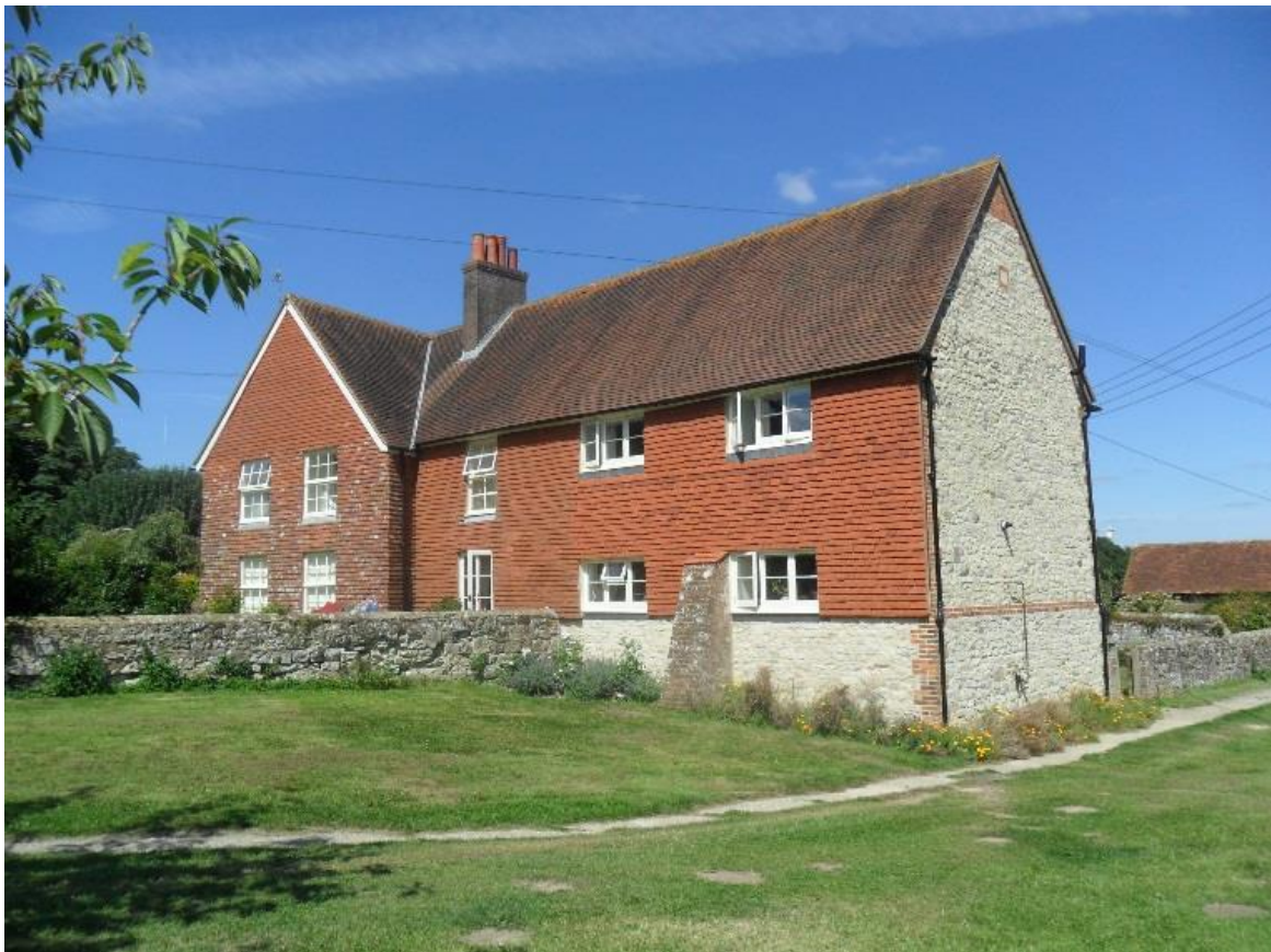
(1 Upper Chancton)