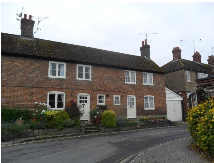
(2&3 Whitehorse Square)