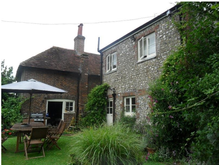
(1 Round Robin)