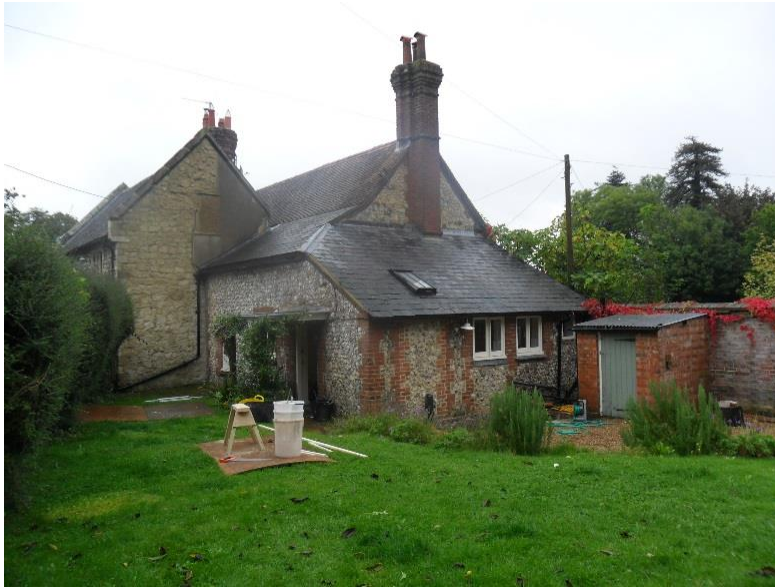
(1 Garden Cottages)