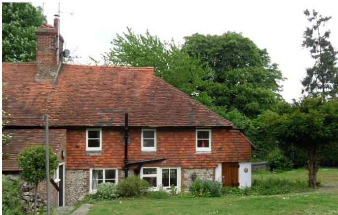
(1 Church Lane)