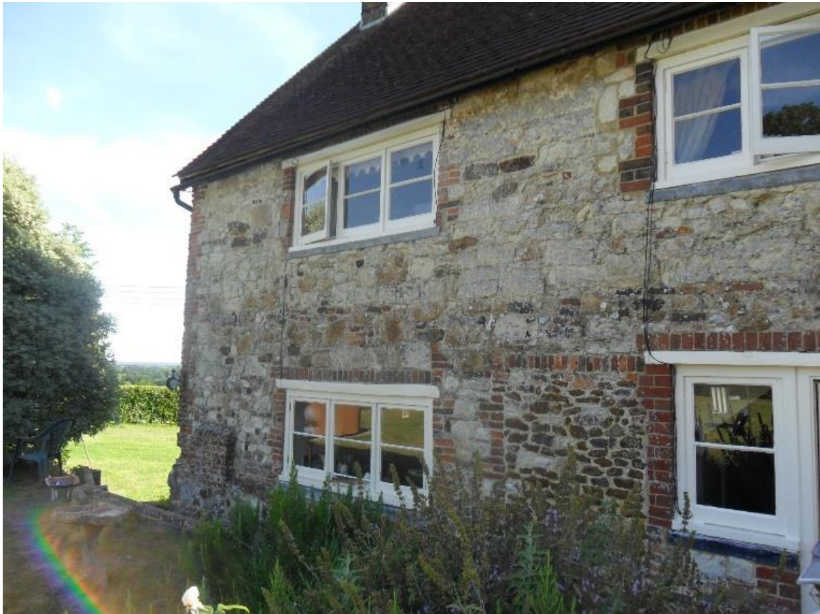
(2 Upper Chancton)

- Comprises of Entrance Hall, Sitting Room, Dining Room, Kitchen/Breakfast Room, Utility Room. On the first floor, four Bedrooms, Family Bathroom.