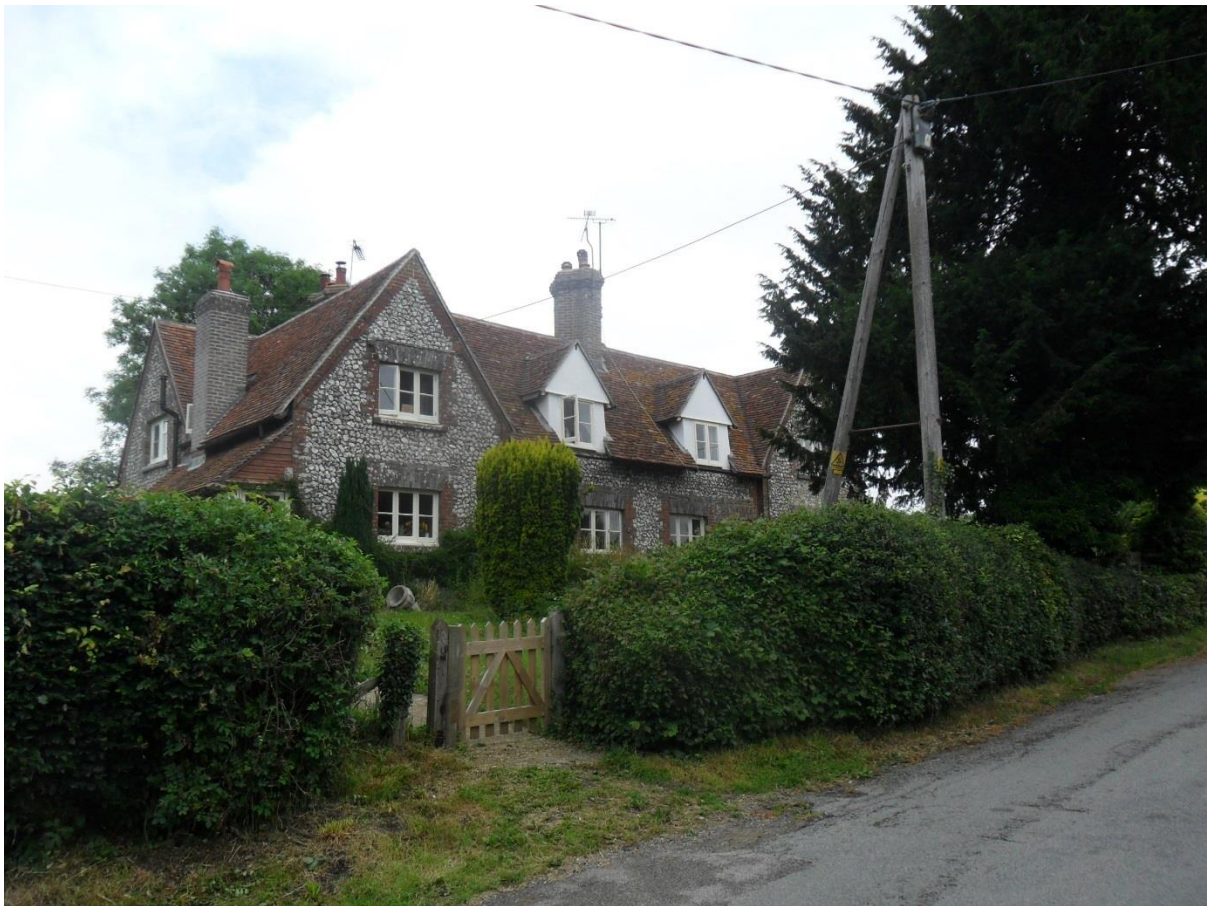
(1 to 4 Stocks Hill)

Name - 1-4, STOCKS HILL District - Horsham Grade - G II List UID - 1027155 OS Grid Reference - TQ 11 SW 12/351 Summary - Mid C19. Two storeys. Five windows. Faced with flints with red brick dressings and quoins. Gable at each end. Two gabled dormers between. Tiled roof. Casement windows. • 1 Stocks Hill – 2 bed attached REFURBISHED 2016 . Electric storage heaters • 2 stocks Hill – 2 bed attached REFURBISHED 2014 – solid fuel heating and electric storage heater • 3 Stocks Hill – 2 bed attached REFURBISHED 2010 – oil fired heating • 4 Stocks Hill – 2 bed attached – Condition: DATED . Solid fuel heating