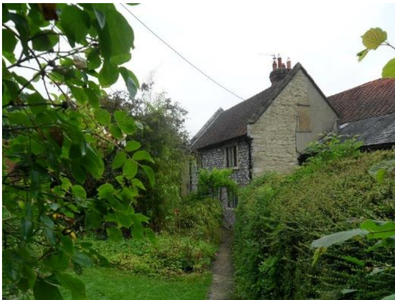
(2 Garden Cottages)