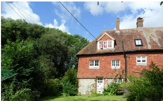
(2 Charlton Court)