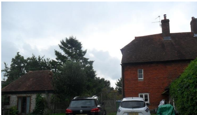
(1 Charlton Court)